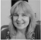
MA Prof of Graphic Design, UCA